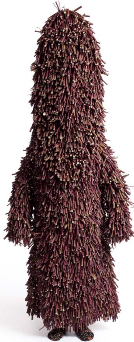
Nick Cave Soundsuit , 2010 Mixed media 96 x 33 x 27 in. (243.8 x 83.8 x 55.8 cm) Courtesy of the artist; Jack Shainman Gallery, New York Photo: James Prinz