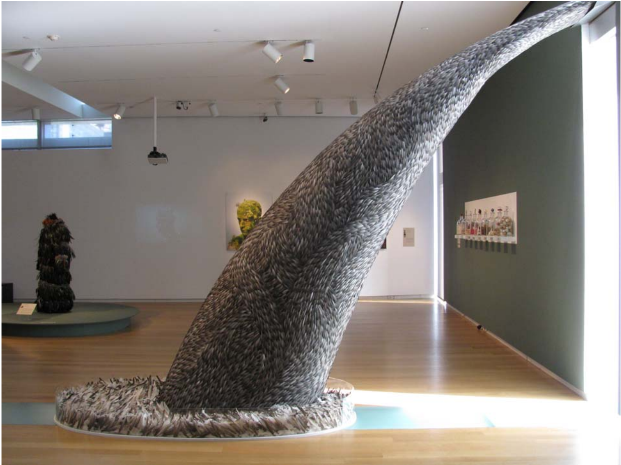
Kate McGwire Discharge , 2010 Pigeon feathers, mixed media