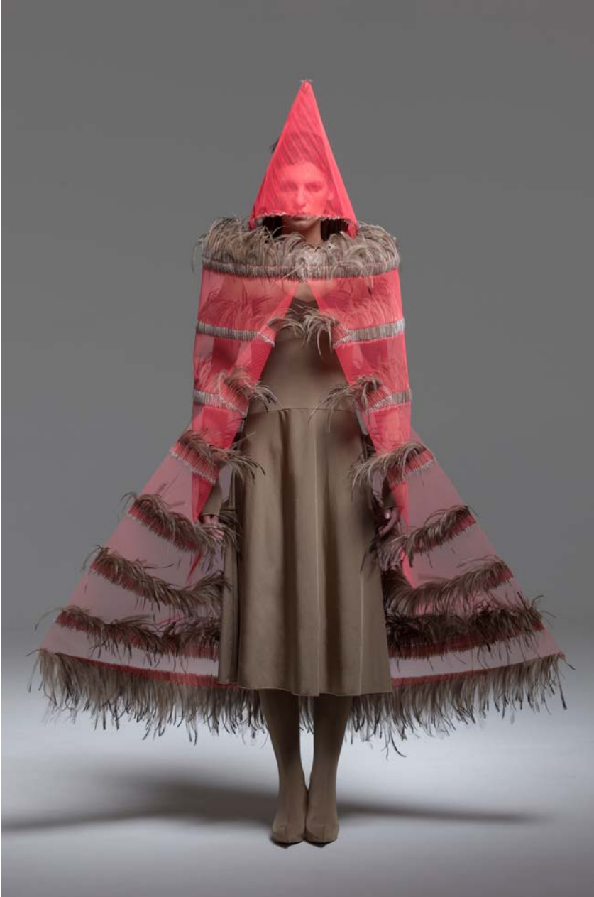
Maria Fernanda Cardoso, Emu Flag + Cloak (Fluro Orange) , 2006–8 Nylon netting, emu feathers, glue, fiberglass rod, metal, lambda print 47 x 55 x 23 in. (119.3 x 139.7 x 58.4 cm) (cloak) Collection of Artists' Legacy Foundation, Oakland