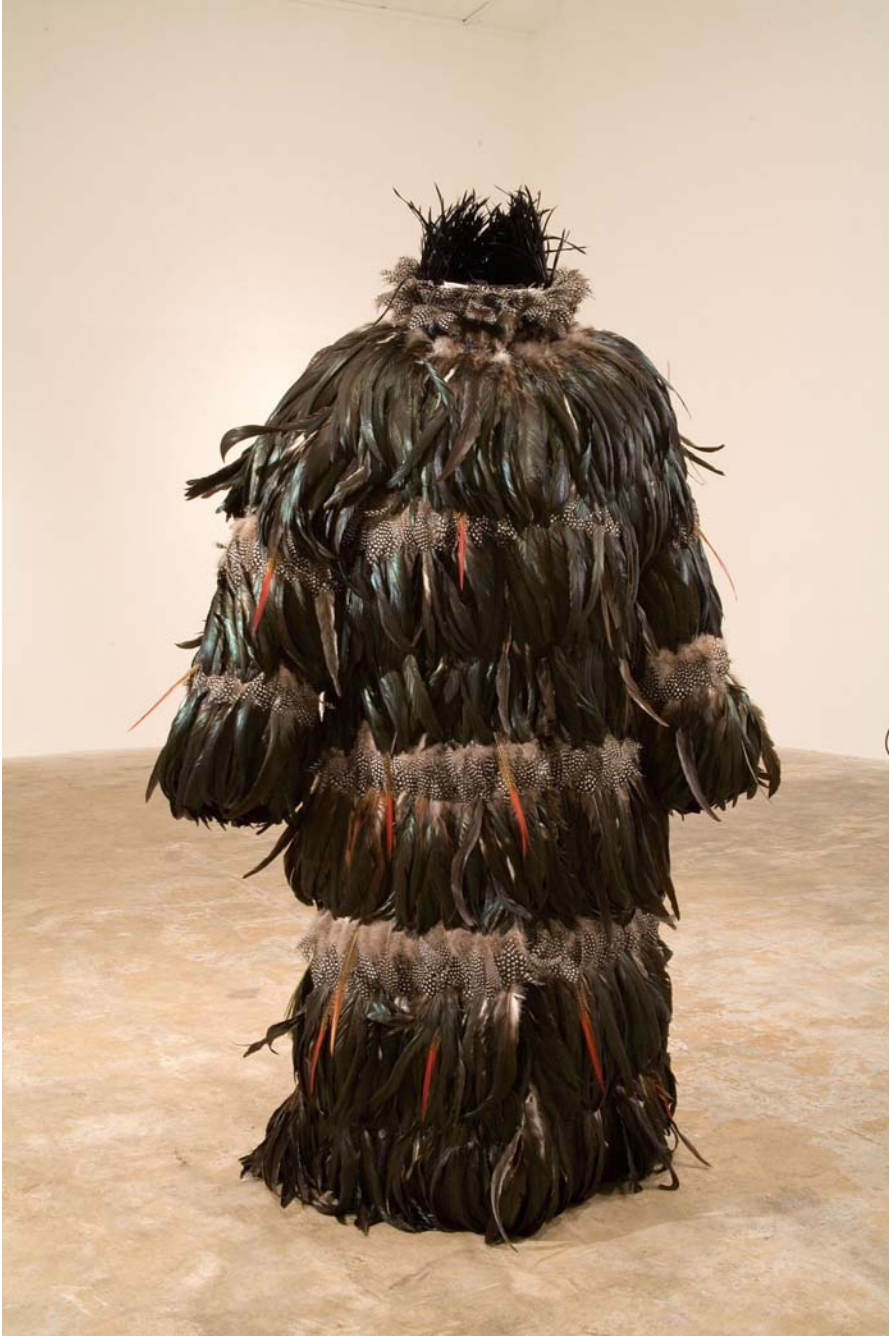
Sanford Biggers Ghetto Bird Tunic , 2006 Bubble jacket, exotic feathers, 61 x 31 in. (154.9 x 78.7 cm) Courtesy of the artist; Michael Klein Arts, New York Photo: Joshua White Collection of Artists' Legacy Foundation, Oakland