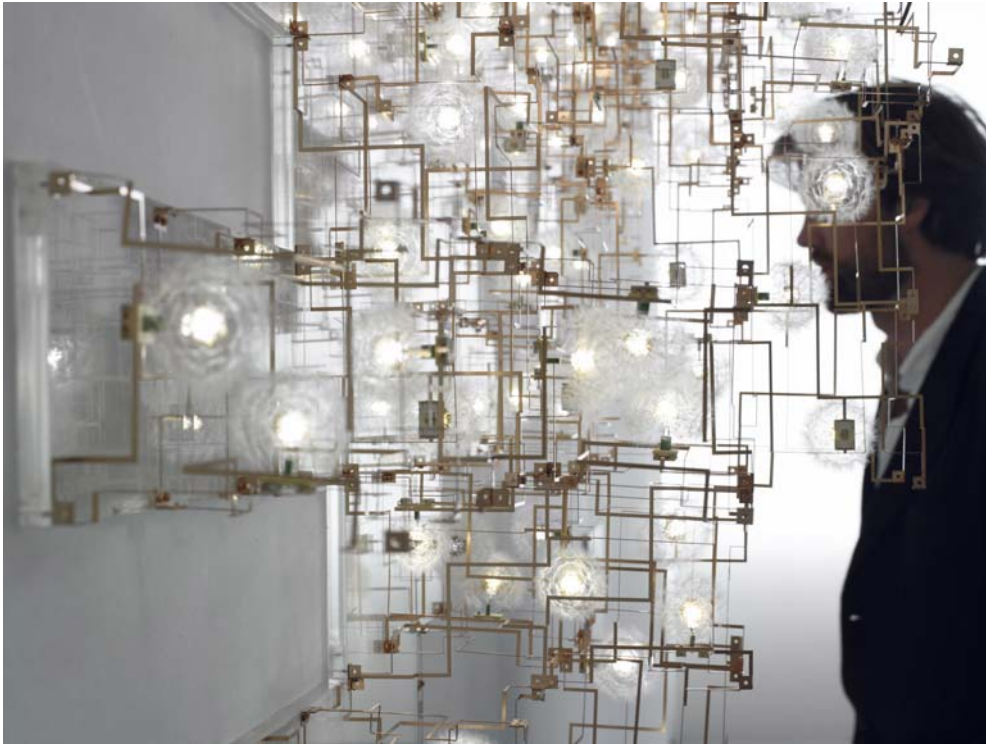
Lonneke Gordijn and Ralph Nauta Fragile Future.3 , 2009 Phosphorus bronze, dandelion puffs Dimensions variable