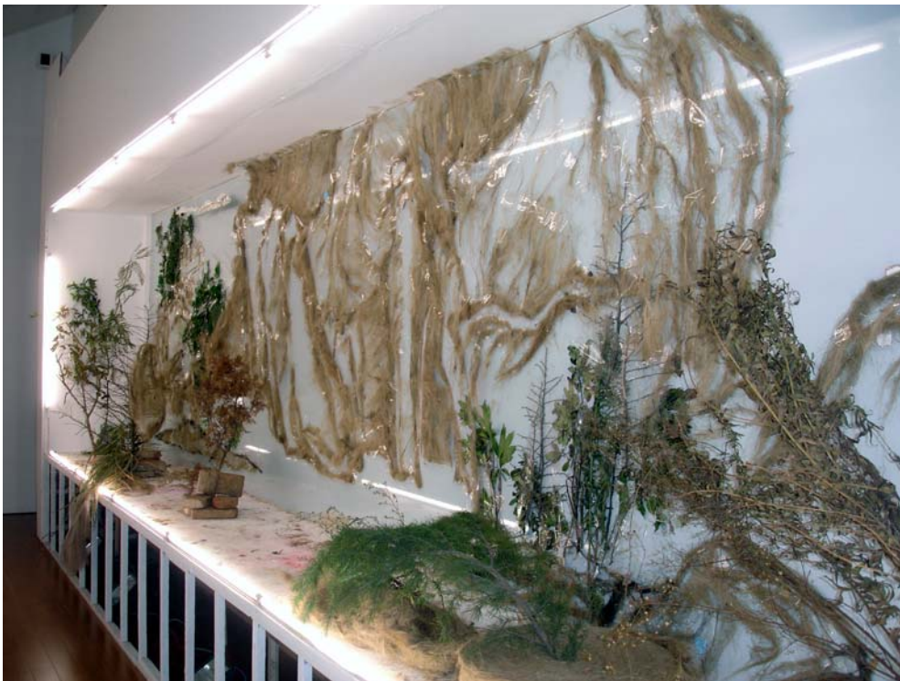
Behind the installation, viewers are invited to see how Xu Bing installed the artwork