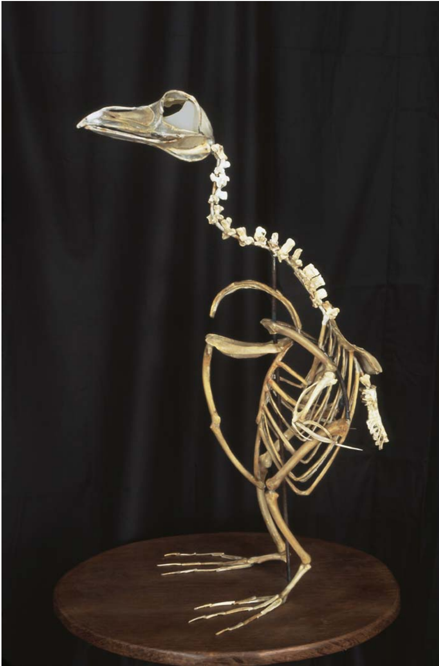
Christy Rupp Great Auk, Iceland, 2007 Fast-food chicken bones, mixed media 29 x 17 x 20 in. (73.7 x 43.2 x 50.8 cm) Courtesy of the artist; Frederieke Taylor Gallery, New York Photo: Nick Ghiz